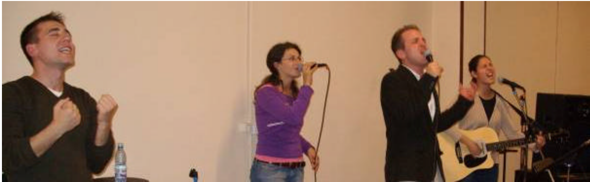
Breakthrough in worship