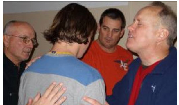
Prayer ministry by laying on of hands